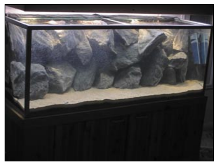
The artificial stones form a rock wall background for the Tanganyikan biotope in mind. It would be very risky to use this much rock if they were real stones.

The stones shown are the only examples I've tried so far, but with the same technique you can make hiding places from a tree trunk or copy the surface of a large rock for a background.