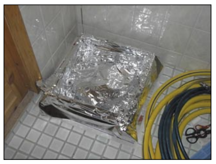
The stone and the glue mold are carefully covered with aluminum foil.

thane foam from sticking into the mould, make sure there are no holes in the foil. You can even use two layers of foil laid in opposite directions.