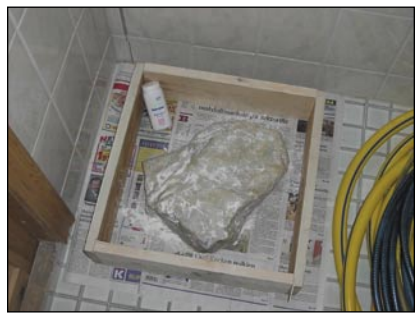
The stone is sprinkled with talcum powder for easier handling.

As the mould's surface is still quite sticky due to the glue, it is easier to handle if you use a layer of talcum powder.