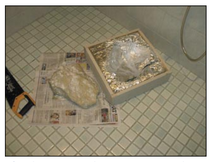
After drying overnight, you can remove the stone from the cradle.

When taking off the mould from the stone, use talcum powder. The surface of the mould against the stone can still be sticky and may stick to itself, which can ruin the process. Dust the stone as you take it from under the glue mould.