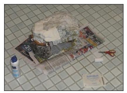
After a couple of layers, gauze was added to provide strength.

a few more layers of glue until there were six layers in total and let them dry overnight.