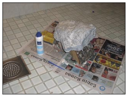
Drip the first layer of glue on the stone that you wish to duplicate.

After a couple of hours, once the layer was skin dry, I added a new layer with a brush. Then I added a third layer, coating with gauze first to make it stronger and then glue so that the gauze was wet. Then I added