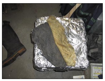
Remove the mould from the artificial stone: start with the edges and peel back gently.

Let the mould dry overnight and then gently touch the surface of the lacquer. If the lacquer is sticky, let it dry some more. If it feels hard, you can peel it off the cast. It's easier if you start with the edges and peel them off gently so the stuck lacquer won't crack or damage the mould. After peeling off the edges you can pull the cast off the mould like you would peel a banana.