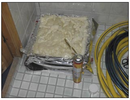
Spray the foam on the foil-covered mould.

After that, spray the foam on top of the foil-covered mould. Let the foam dry overnight and then you can open the package!