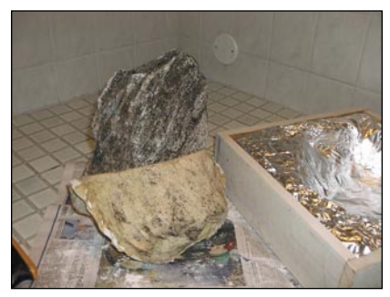
Peel the mould from the stone. Again, use talcom powder liberally.

When taking off the mould from the stone, use talcum powder. The surface of the mould against the stone can still be sticky and may stick to itself, which can ruin the process. Dust the stone as you take it from under the glue mould.